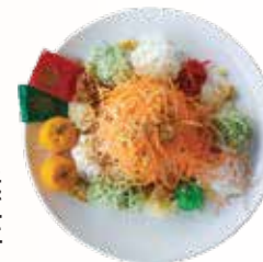
买四套餐赠送 Buy any 4 sets FREE

团圆饭配套 Reunion miniBuffet 19th Jan - 4th Feb 2019