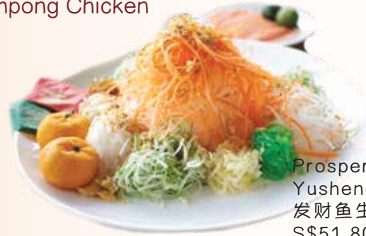
Prosperous Abalone Yusheng 发财鱼生 [鲍鱼] S$51.80 w/GST

Set C S$188.00 w/ GST (5人份) 葱爆海参 Braised Sea Cucumber with Spring Onion 甘榜火腿玉兰鸡 Harvest Poach Kampong Chicken 白果芋泥 Taro Yam Paste with Gingko Nuts