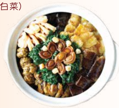
买三套餐赠送 Buy any 3 sets FREE

Set D (8人份) S$298.00 w/GST 聚宝盆 Harvest Treasure Pot (鲍鱼, 海参, 蠔市, 鱼鳔, 干贝, 大虾, 发财肉丸 鲜鸡, 香菇, 白菜)